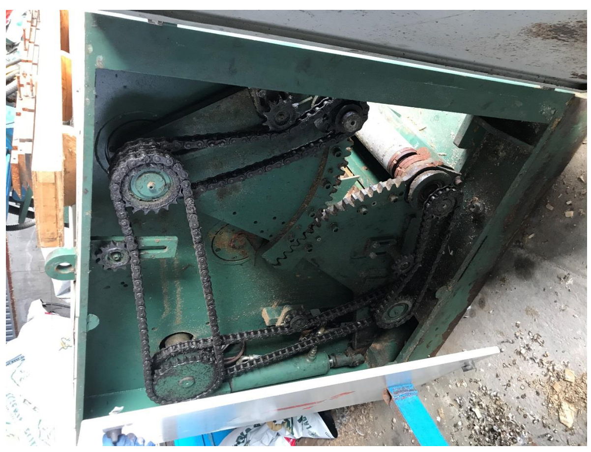
Page 3 | 3